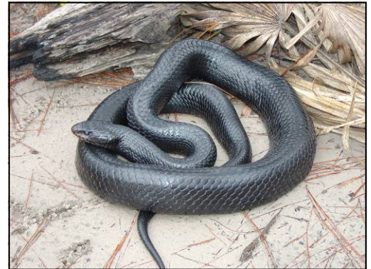
Indigo snake.