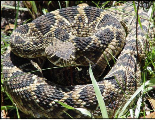
Eastern Diamondback Rattlesnake

Rattlesnakes are arguably among the most recognizable venomous snakes and have a long and storied history within the United States. The following quote from Benjamin Franklin underscores the awe and fascination inspired by rattlesnakes: "She never begins an attack, nor, when once engaged, ever surrenders: She is therefore an emblem of magnanimity and true courage...she never wounds 'till she has generously given notice, even to her enemy, and cautioned him against the danger of treading on her." These snakes, which are found only in North and South America, are also the subject of much fear and misunderstanding.