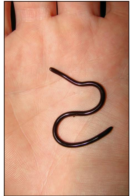
Brahminy blind snake.